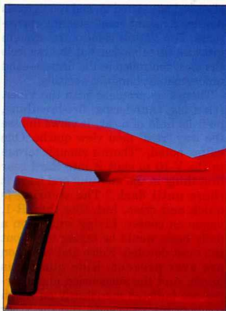
Lotus is a world leader in the design and manufacture of fiberglass components and structures.

Commonalities among sedans are many, but the design philosophies of sports cars are much more free ranging. Each of our Top Gun players has a distinct technological personality, six different answers to one question.